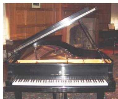
Philips Autograph Library Site of Institute Master Classes and Lessons