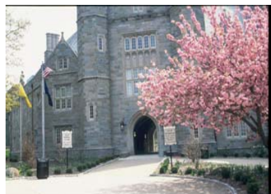
Emilie K. Asplundh Concert Hall Philips Memorial Building, West Chester University

All meals are served cafeteria-style in the University dining hall. Choose from a wide variety of foods. Meals are provided beginning with breakfast Monday, July 12, through breakfast on Saturday, July 24.